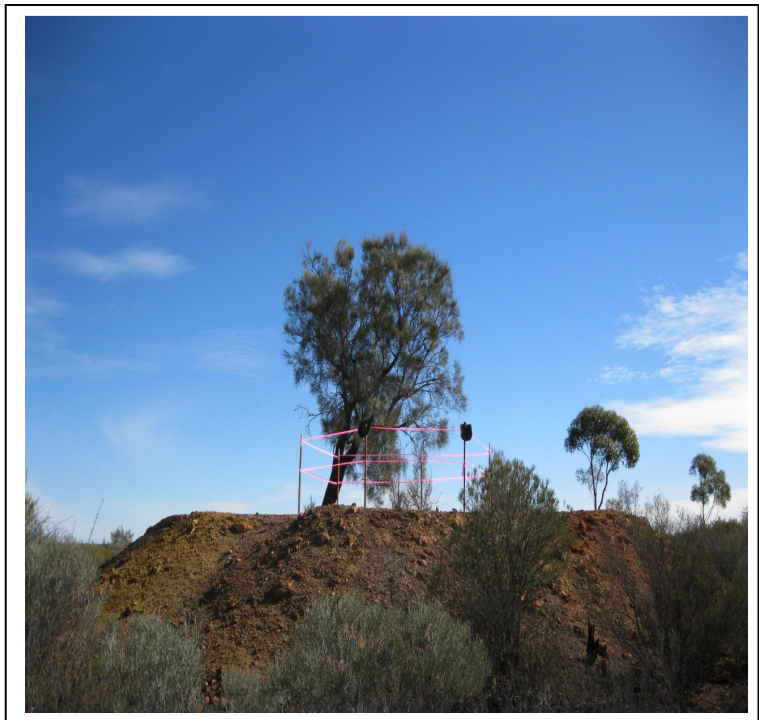
Figure 3: “Rediscovered” old gold workings