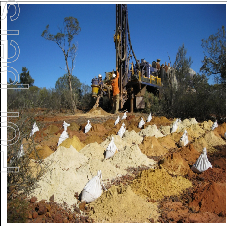
Figure 2: RAB drilling, September quarter 2010